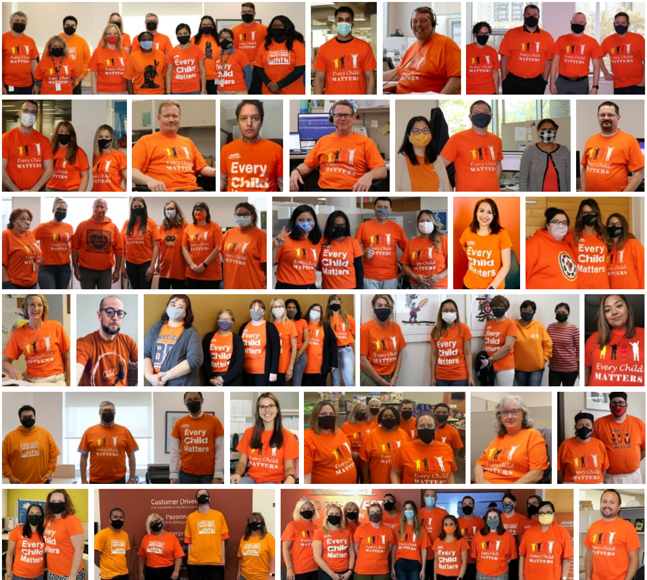
North West staff members from Gibraltar House wore orange on September 30.