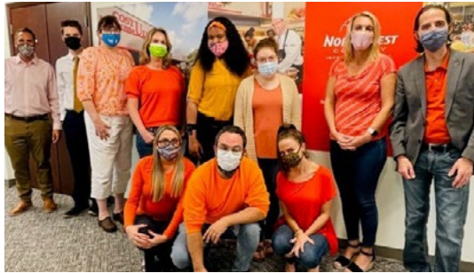
Top row: Nor'Westers at the front and back of the operations joined together on Orange Shirt Day and showed their support by wearing orange. (Left) North West staff members from Cost-U-Less, Boca Raton, FL and Winnipeg Logistic Service Centre staff members.