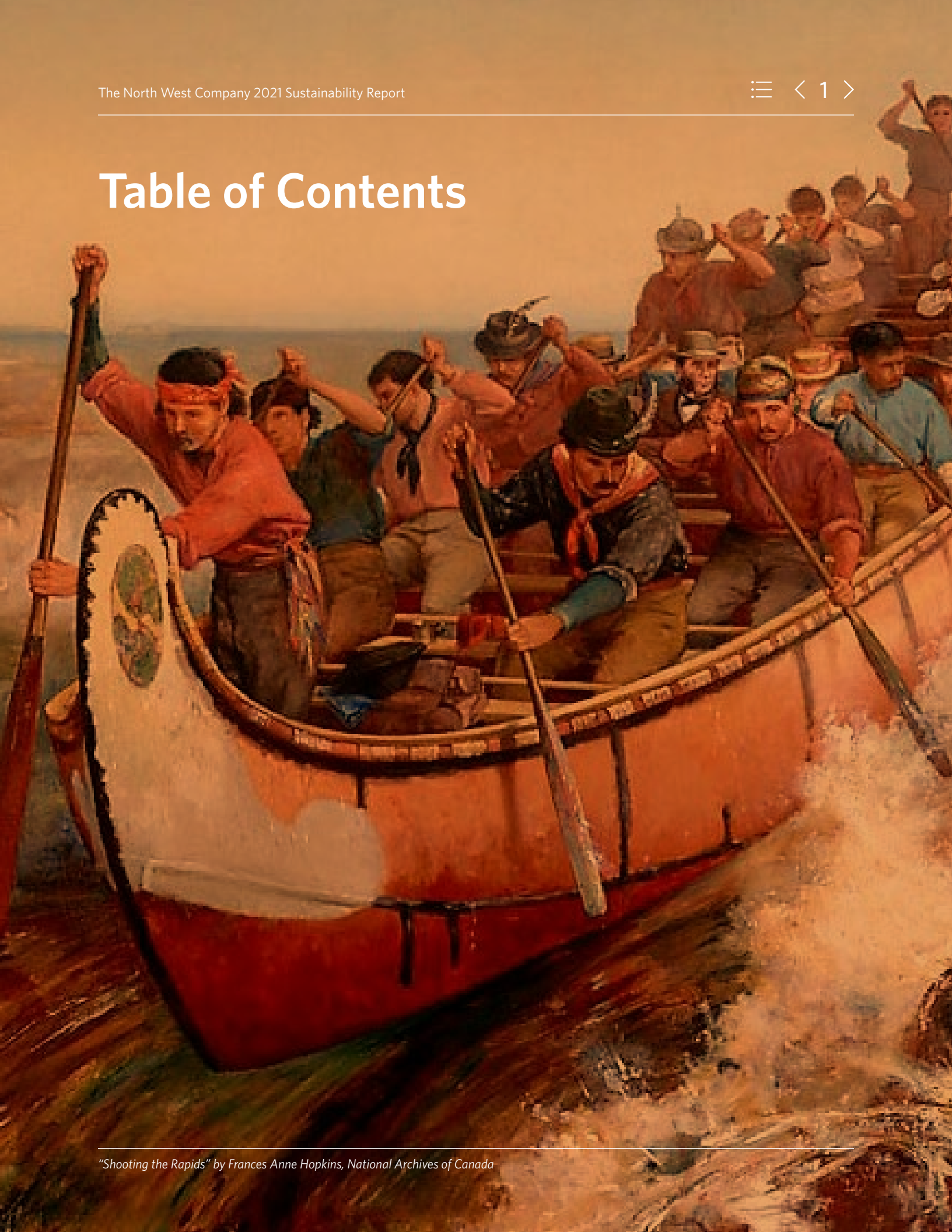
"Shooting the Rapids" by Frances Anne Hopkins