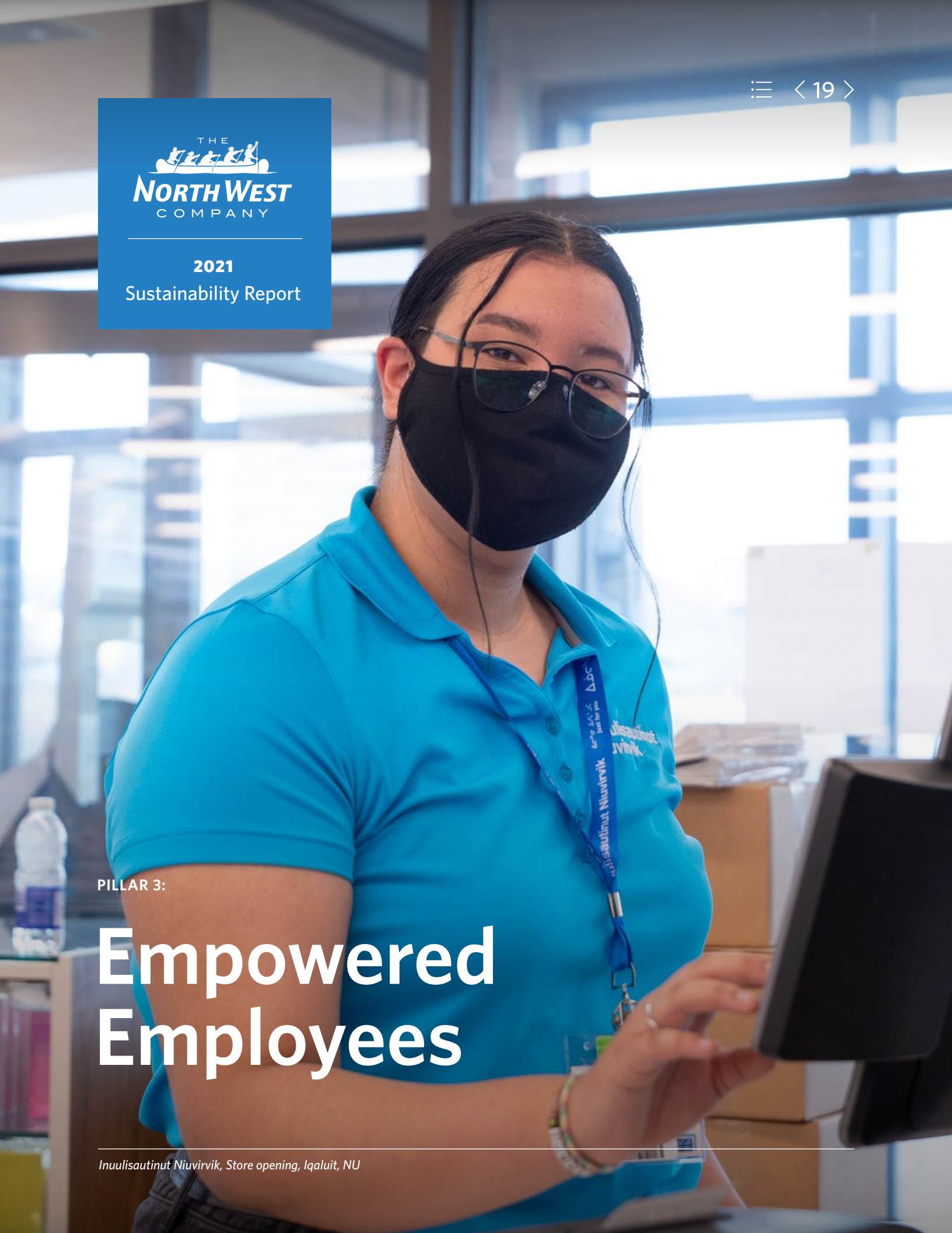
Inuulisautinut Niuvirvik, Store opening, Iqaluit, NU