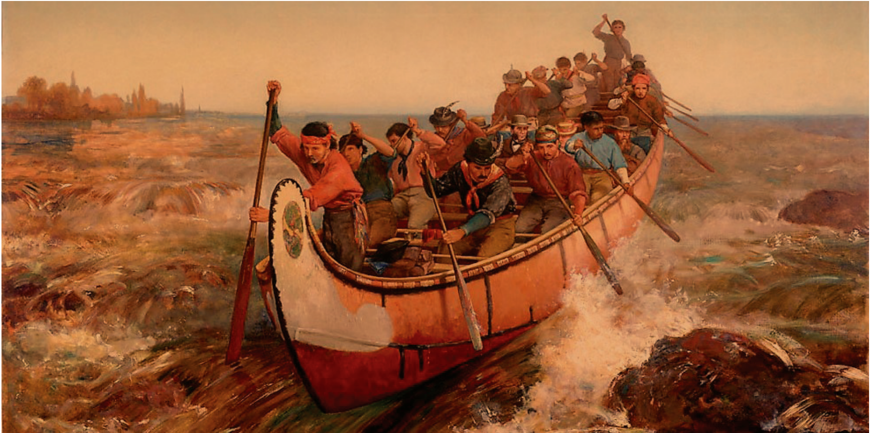
"Shooting the Rapids" by Frances Anne Hopkins

The North West Company ("NWC" or "North West") recognizes its longstanding relationship with Indigenous Peoples and its role as the largest provider of goods and services to Indigenous communities in northern Canada. North West's predecessor entities were fur trading and provisioning companies that economically